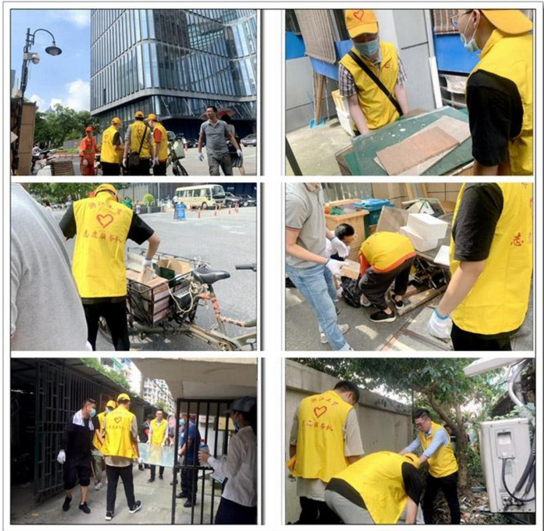
To build a beautiful community, ZJNAC volunteers are on there way.