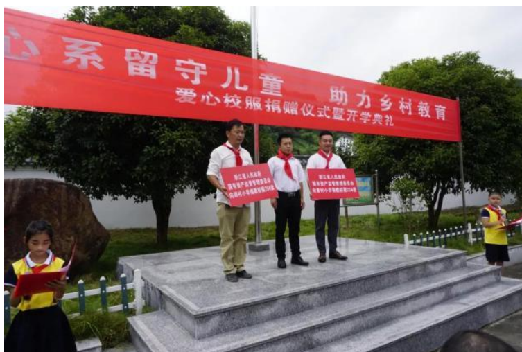
Donation of school uniforms to Jinyun County Primary School.

Secretary Xi Jinping’ s proposal of “Poverty alleviation ambition first, poverty alleviation must support wisdom, and no matter how poor it is, no education can be poor” . Important statement, with a high sense of responsibility and mission, and strive to provide assistance to the national education cause. In 2019, with the support of the Provincial State-owned Assets Supervision and Administration Commission, the company donated two sets of summer school uniforms to each of the total of 250 students in the two primary schools in Zhangcun and Hucun, Jinyun County, with a total value of 30,000 yuan; in 2020, the company instructed its subordinate Kaixing animal by-products which project launched by territorial government .The government donated 300,000 yuan for the relocation and construction project of the Zhouquan Town Central Primary School.