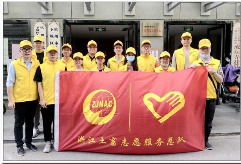
ZJNAC Volunteer Service Team