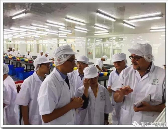
EU FVO certification