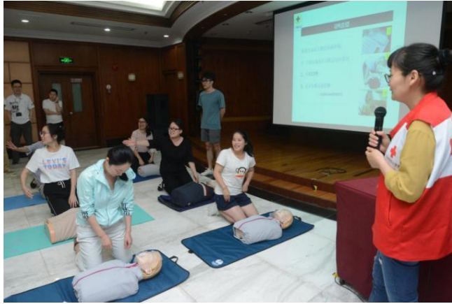
First aid training