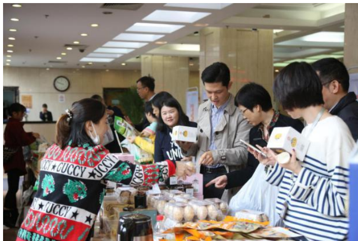
Contractors of the International Trade Group's poverty alleviation product fairs.