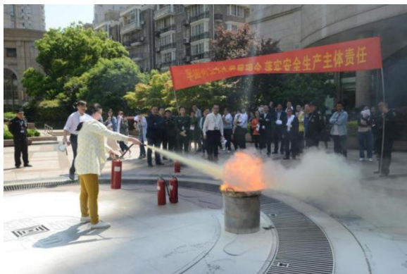
fire fighting practice exercises