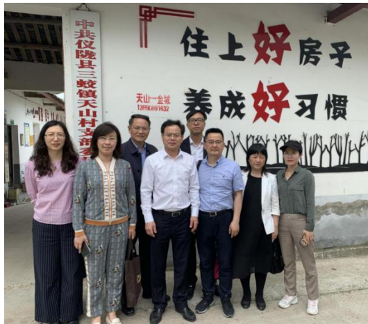
Paired with Yi Long county, Sichuan province

have promoted the large-scale development of the citrus industry, thereby laying a long-term foundation for increasing income and alleviating poverty for the local people, activating the endogenous driving force for the development of the three agricultural industries.