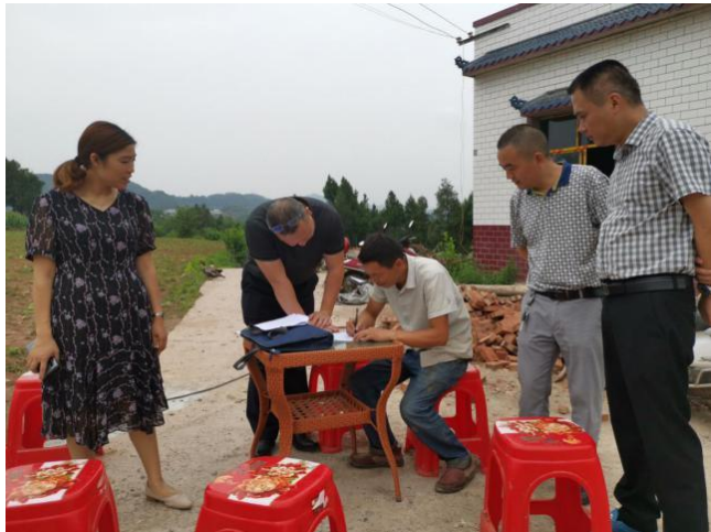
Villagers sign up contracts in Saijin Town.

(2) . The pairing project to help the rural poor in Zhejiang Province. The pairing project of Zhejiang Province was established in Zhangcun Township, Jiangshan City. The company invested a total of 900,000 yuan annually for three consecutive years to help Support the construction of the Zhuangyuan' s Farmhouse B&B complex project in the paired Pioneer Village. By improving the village' s living environment, highlighting the village' s ancestral shrine and the cultural heritage of the Zhuangyuan' s hometown, it strongly