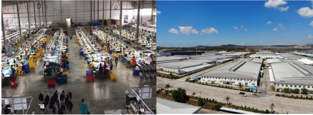
Cambodia's luggage processing factory