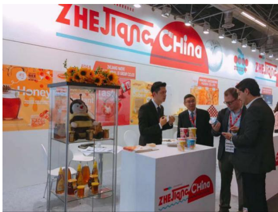
developing the African market

(2) Actively devotes to the strategy of "opening up and strong province" In recent years, the company has accelerated the construction of a "bi-circulating of domestic and international " new development pattern", and established a stable partnership with world-renowned meat, supermarkets, and dairy groups and accelerate the internal construction of large-scale supermarkets, franchised dealers, catering companies, e-commerce platforms, government and enterprise units and other sales channels . The company makes full use of the big Expo platform provided by the strategic opportunities, signed a total of 120 million U.S. dollars in three sessions, and the