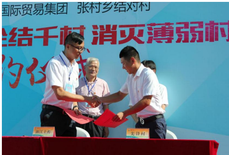
Signing Ceremony of the pairing project to help the poor

promotes the development of the local tourism industry and achieves a win-win situation for both the village and the rich. The company has also organized the purchase of local specialty macaque monkeys for many times and actively participated in consumer poverty alleviation, “buying instead of donating” and “buying instead of helping” , and strive to be a good practitioner and vanguard of consumer poverty alleviation actions.