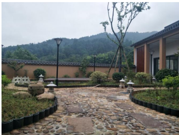
Farmstay Homestay Project in Zhangcun Township