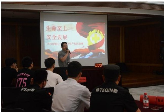
production safety knowledge competition