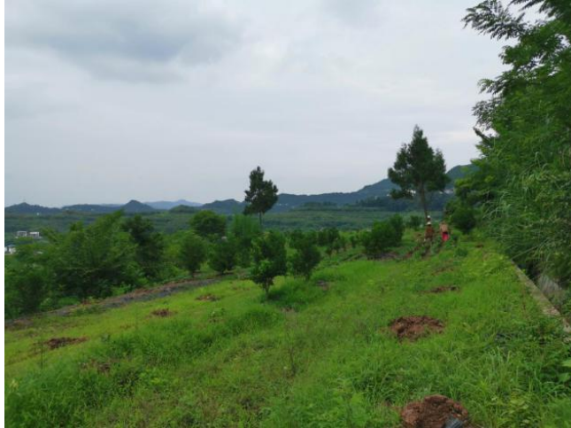
Orange Garden in Saijin Town