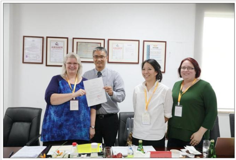
Successfully passed the US Department of Agriculture on-site accreditation inspection.